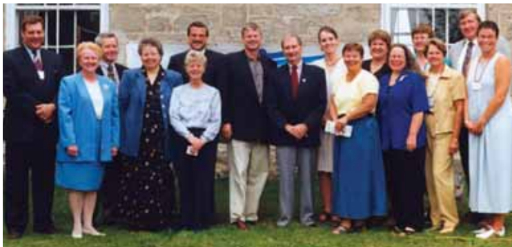
THE HONOURABLE LYLE VANCLIEF, then Minister of Agriculture and Agri-Food Canada (middle) joins an inaugural gathering of TORC members in 1998.

The energy was high during the early years. Success beget success as new projects presented themselves and partnership opportunities grew with TORC's credibility and recognition – even in the international arena. The Council's strength was resident in the flexible nature of the organization and the visionary leaders it attracted to its management team. This was a learning organization. We were striving for excellence. There was continual reflection upon the goals, processes, outcomes and required changes to maintain effectiveness and relevance. It was also an innovative organization acting as a rural hub or cluster that brought together creative thinkers from across diverse sectors to plan for change.